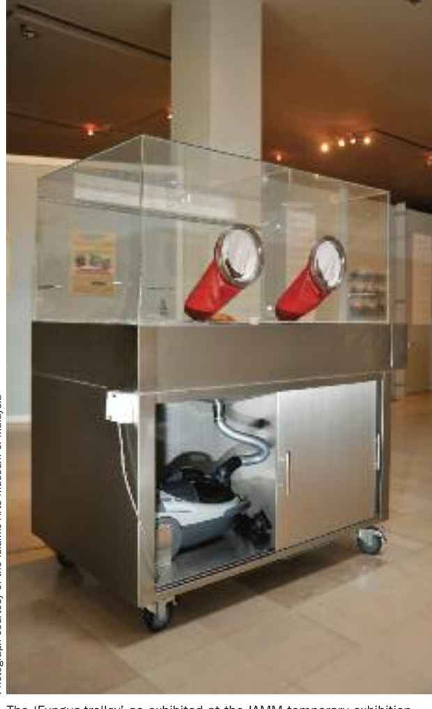
The 'Fungus-trolley' as exhibited at the IAMM temporary exhibition 'Behind the Scenes' in 2010

The Fungus-Trolley is a stainless steel trolley with a suction table at the top, and enclosed by a Plexiglas incubator chamber. A vacuum cleaner, equipped with a HEPA filter is located within the cabinet on the lower part of the trolley. The vacuum cleaner provides the suction for the suction table