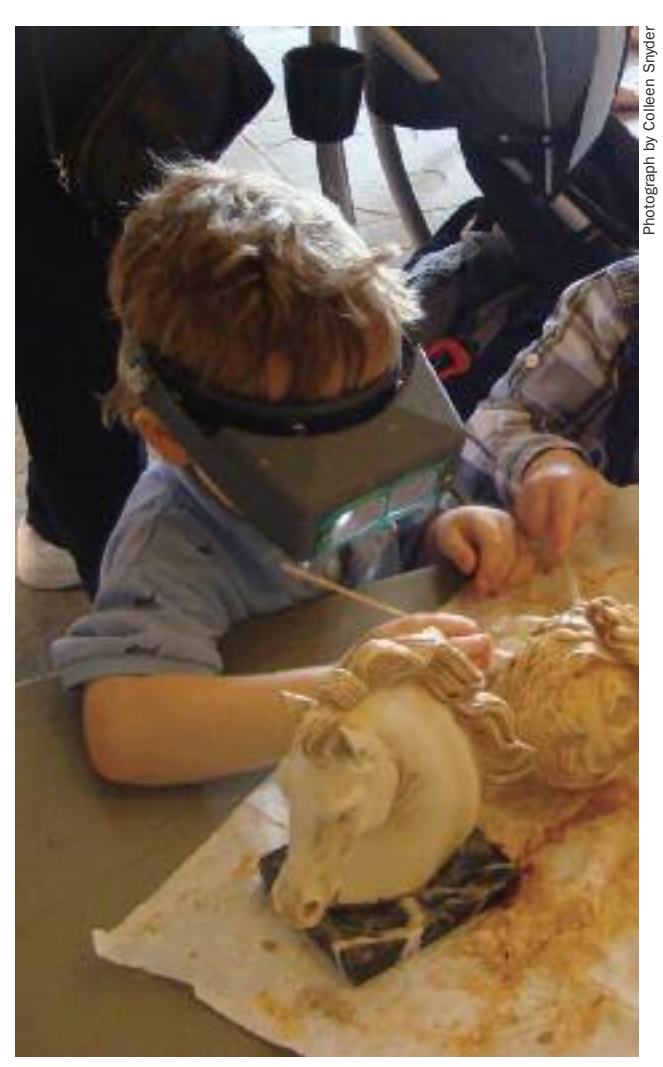
This enthusiastic 'conservator' was terribly disappointed when all the dirt had been removed!

After an object has been excavated, and archaeologist may enlist the help of a conservator to clean and preserve the object. A conservator is a person responsible for the care, repair, and preservation of works of art, buildings, or