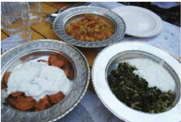
A selection of dishes

Some people do not see food as a culture carrying concept. Food preparation is a precious thing, a cultural narrative. We have to preserve it. Our magazine, YemekveKültür (FoodandCulture) attempts to record and perpetuate this narrative, rather than being concerned with commercial interests. The main aim of YemekveKültür is to preserve culture; not profit making.