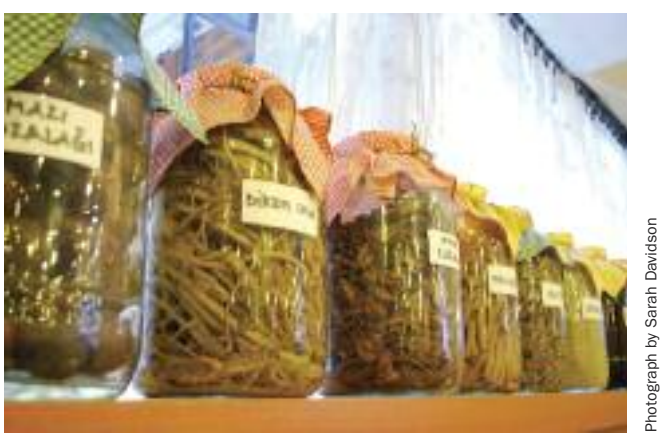
Dried and pickled produce including dried quinces.

working on protecting the surviving Tandoors in Diyarbakır.