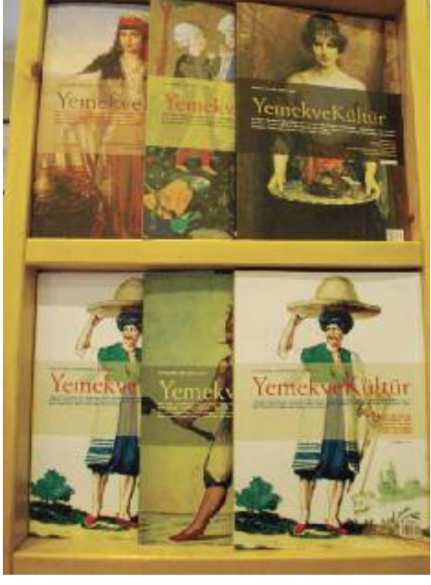
Issues of YemekveKultur (Food and Culture)