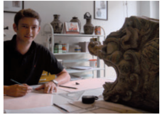
The author working in the laboratories at the Center for the Conservation & Restoration of Cultural Property, Xi'an.