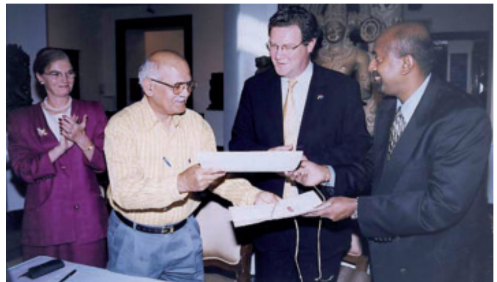
The signing of a Memorandum of Understanding between AusHeritage and INTACH in April 2007.

Being flexible and developing cross-cultural skills to understand the local situation is important. It is a lifelong learning exercise and the knowledge is cumulative.