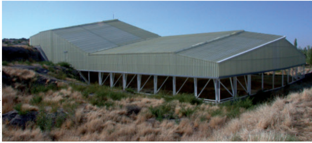
The existing South shelter