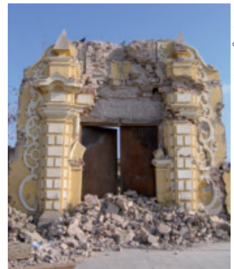
Rommel Angeles Falcón