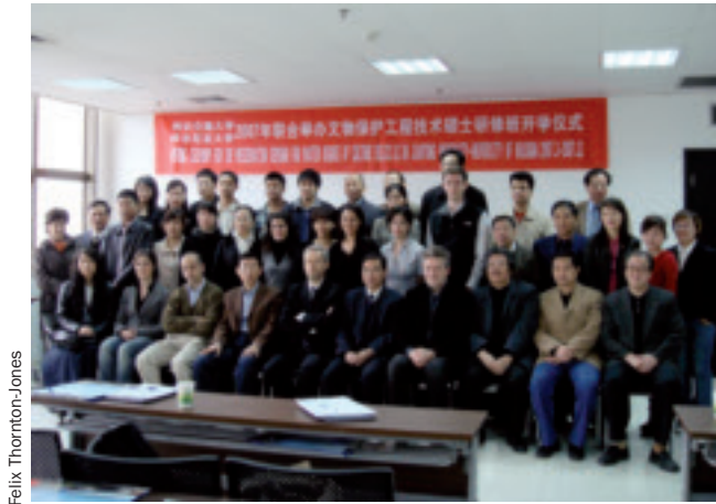
The opening ceremony of the Masters in the Conservation of Archaeological Materials in Xi'an Jiaotong University, Xi'an, China (March 2007). The author is in the center row, sixth from the right.