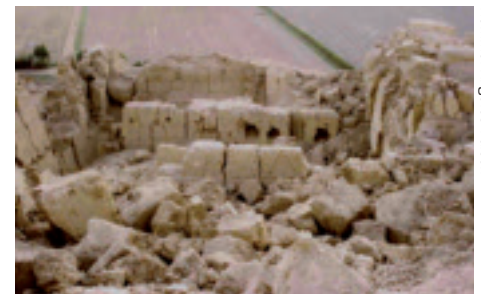
Rommel Angeles Falcón