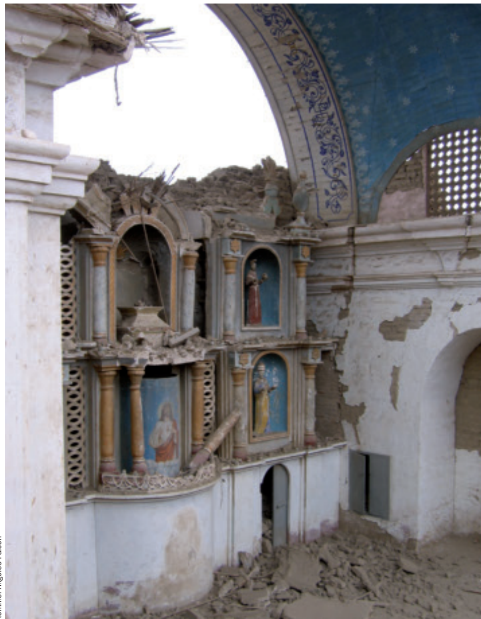
Rommel Angeles Falcón