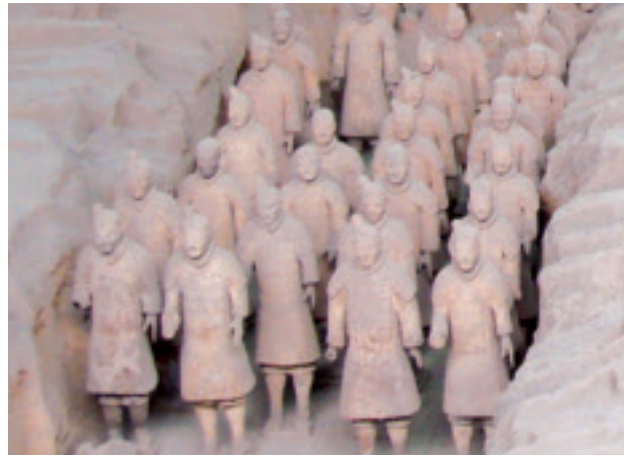
The Terracotta Warriors, discovered near Xi'an, guarding the tomb of China's first Emperor (Qin Shihuangdi).