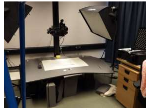
The photographic stand in the BL/Qatar digitisation studio

Identifying right from the beginning the portion of the collection that is fit for digitisation can save time while at the same time giving an idea for estimating time needed for future conservation. Having Conservation/Preservation expertise on board means being able to cover all aspects related to the security of the items. Conservators provide monitoring and risk assessment covering the entire workflow together with training for staff involved in handling the collection.