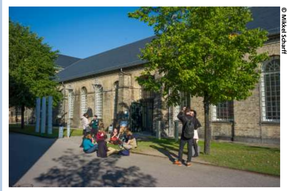
Relaxing outside the Conference main venue

Discussions continued outside the sessions during the social event. Here a platform was created for professional networking, which may result in further collaboration between people within the field, nationally as well as internationally.