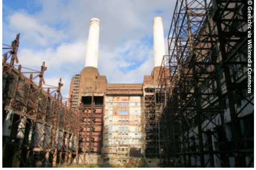
Battersea Power Station after the roof was removed

Published every two years since 1996, the World Monuments Watch List