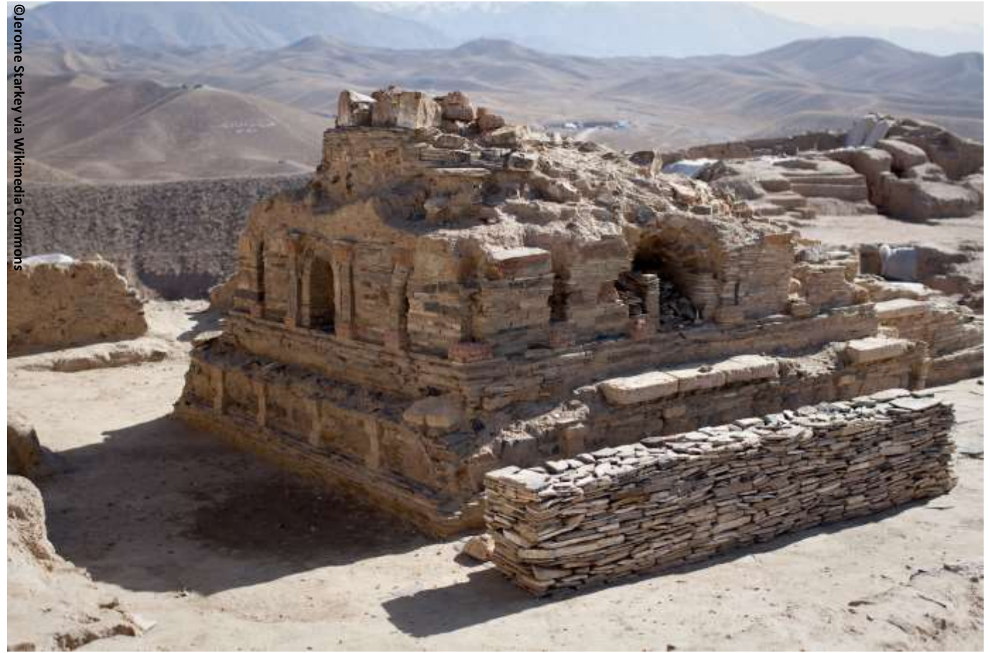
An ancient stupa at Mes Aynak, Afghanistan

MES AYNAK – A four-square-kilometre site in the Mes Aynak area of Afghanistan, which is home to a wealth of ruins as old as 5,000 years, is threatened with destruction after the Afghan government sold mining rights to a Chinese company in a deal that is reportedly worth US$3bn (£1,86bn). The area is in fact also rich in copper, a very valuable commodity for a country that needs the cash desperately. The site, which is an hour's drive from the capital Kabul, also contains the remnants of many Buddhist monasteries that stood here for hundreds of years.