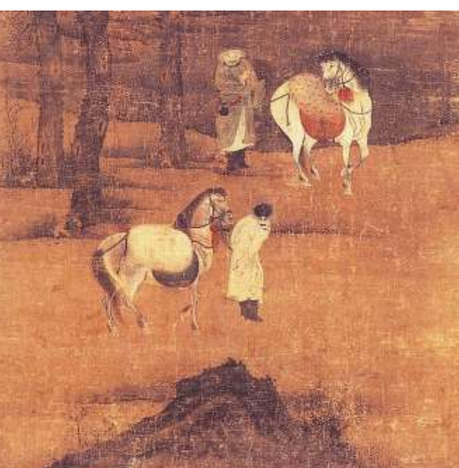
Winter landscape with barren trees and two horsemen by Song Dynasty Chinese artist Liang Kai, early 13th century, a hanging scroll with ink on silk, Freer Gallery of Art in Washington D.C.

WASHINGTON - The Arthur M. Sackler Gallery and Freer Gallery of Art announced a new $1 million (£621,000) grant by the Andrew W. Mellon Foundation, for the endowment of a position for a Chinese painting conservator to work