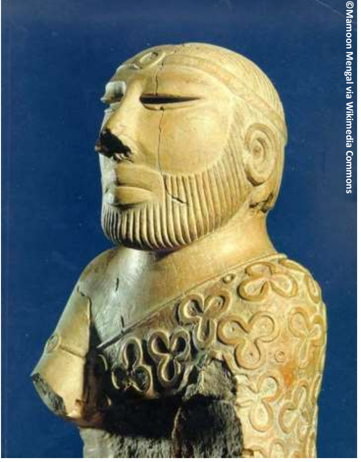
Indus Priest/King Statue from Mohenjodaro. The statue is 17.5 cm high and carved from steatite, National Museum, Karachi, Pakistan

The city was discovered in 1922 but it was not until the 1930s that major excavations were conducted at the site until 1965 when further work was halted due to increased weathering damage to the exposed structures. In more recent times, architectural documentation, surface surveys, and localised probing have taken place at the site.