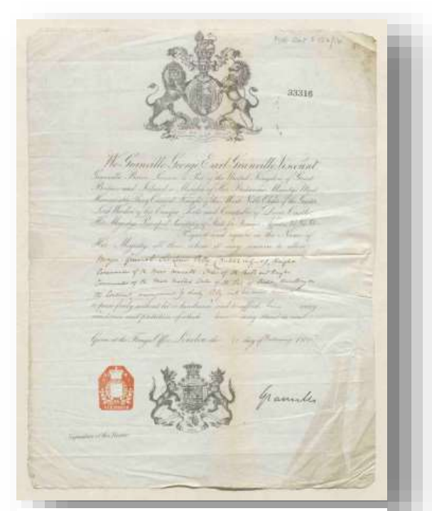
Passport issued to Sir Lewis Pelly

If implemented from inception, conservation can also enhance the value of the project contents by adding expertise that focuses on the physical features of the items and their degradation processes. These inputs together with improving the final results of the project can be instrumental if further funds are needed.