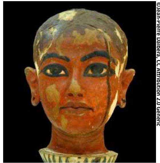
Head of Tutankhamun from his tomb

https://www.youtube.com/watch?v=AGqAggmwyMU