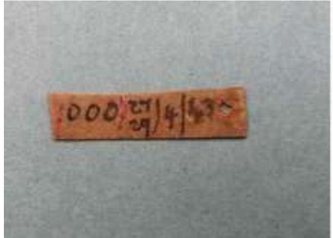
The pins visible from the verso of the map and one of the labels

Choosing the first option would imply that the fundamental causes of the gradual deterioration would remain. The benefit of the second option was the stabilisation of the item as a whole. Prioritising long-term preservation was clearly the route by which to proceed. However, the removal of the 679 labels would be a considerably more time-consuming treatment compared to the first option.