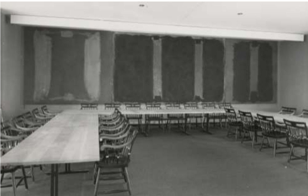
Panel One, Panel Two and Panel Three, 1965

The digital conservation approach used on the works employs specially calibrated light as a tool to restore the appearance of the mural's original colours, which had faded during the 1960s and 1970s when the five large-scale canvas paintings were on display in a penthouse dining room at Harvard University. High levels of natural light coming through the floor-to-ceiling windows ultimately caused Rothko's colours to fade, and the five paintings showed differing patterns of colour loss.