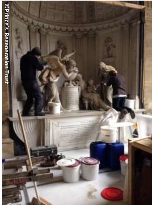
Cleaning the monument to Lady Mary Duchess of Montagu, 1775

WARKTON - Work has started to restore Warkton's hidden treasure, the Montagu Monuments, thanks to a Heritage Lottery Fund (HLF) grant of £318k towards the £489k project. The Montagu Monuments are significant 18th century memorial sculptures in the Grade I listed St Edmund's Church in Warkton, UK and include four marble memorial sculptures of international importance, which draw visitors from all over the world. Two of the monuments were created by French sculptor Louis-François Roubiliac and are considered to be surpassed only by his monument to Lady Elizabeth Nightingale at Westminster Abbey in London.