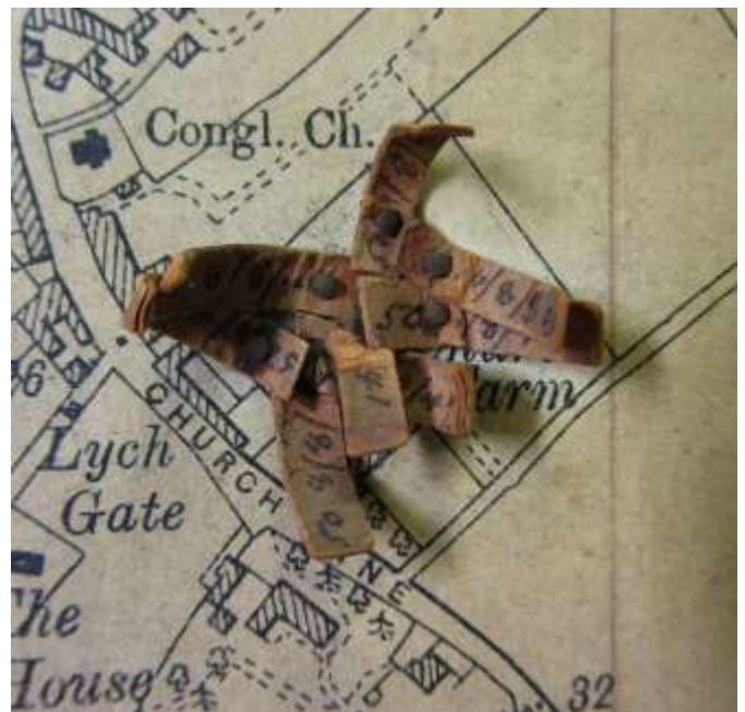
Details of labels and pins on the recto of the map

The scale and complexity of the item as a whole required me to establish the best conservation approach, weighing the benefits of various degrees of intervention against time constraints. As part of this assessment, the individual labels were categorised by condition, allowing me to prioritise their treatment. The markers were therefore divided into the following groups: