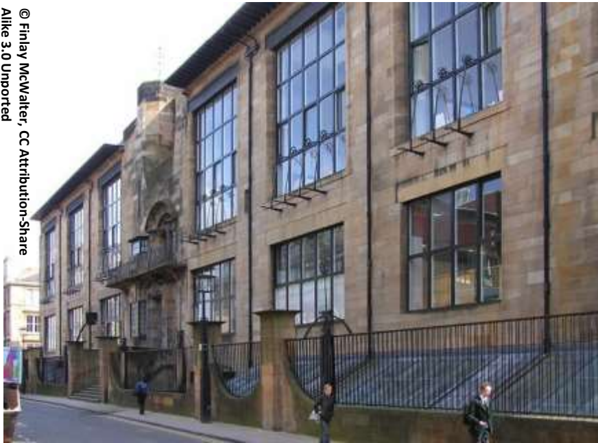
The building before the fire

put out a call for volunteers which resulted in offers of help with a list of people including conservators, joiners, architects and archivists ready to offer their services. The conservation department staff at the National Galleries of Scotland (NGS), were asked to assess the condition of artwork including works produced by undergraduate students for their final degree show. This initial assessment will allow a programme of remedial work to be drawn up.