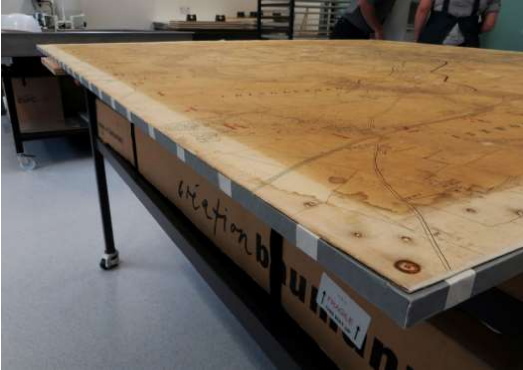
The map during one of the phases of treatment

After reattaching the wooden battens to the new backboard and despite the belief that the map would be used less once digitised, as the intention was to store the map vertically, it was critical to make sure that tension of the whole map was sufficiently maintained. Heavy weight Japanese paper hinges were therefore attached equidistantly along all edges in order to firmly tension the sheet in all directions. The outer stretcher was then reassembled using new stainless steel screws.