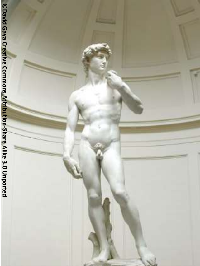
The statue of David in its current location in the Galleria dell'Accademia in Florence

FLORENCE – A new study published in the Journal of Cultural Heritage argues that Michelangelo's statue of David is at risk of toppling under its own weight.