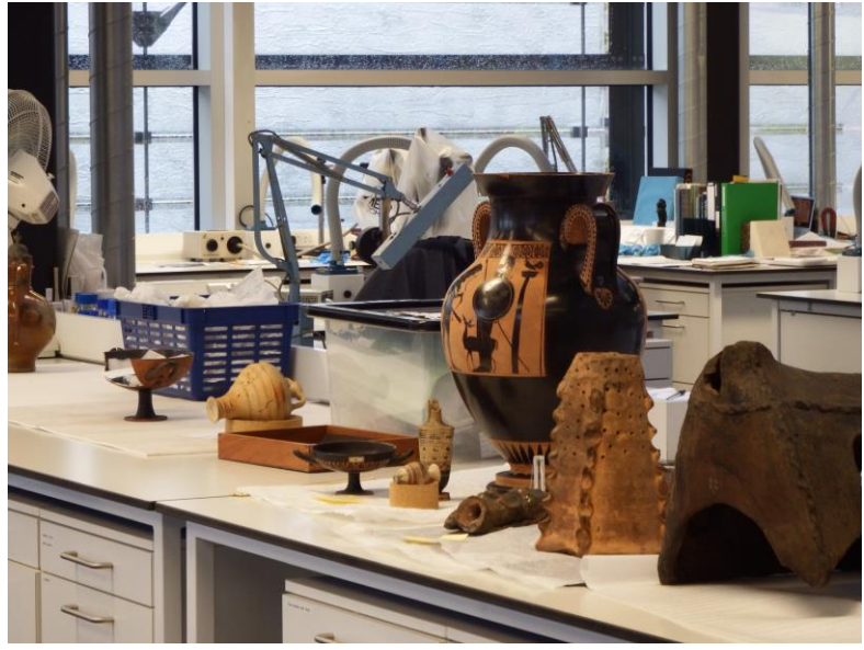
Top image - David Saunders showing a bark cloth in the textile studio. Bottom image - Objects awaiting treatment in the archaeological conservation studio

The studios are indeed impressive but the show-stopper had to be the final studio that we visited: the sculpture studio with its own entrance and direct access forlorries to deliver large sculptures undergoing treatment. Like the rest of the building, this space is simple and minimal but its volume makes it spectacular. A gigantic hoist runs along the ceiling and can transport statues of enormous proportions to the opposite end, where a separate room serves as treatment/examination area.