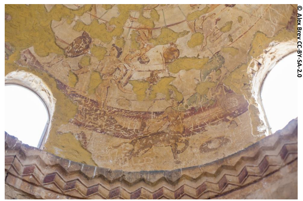
At present, around 25% of the One of the painted ceilings at Qusayr'Amra in Jordan

The UNESCO World Heritage Site was included in 2008 in the World Monument Fund Watch List. In 2009, WMF in collaboration with the Italian Istituto Superiore per la Conservazione ed il Restauro and the Department of Antiquities of Jordan started a pilot project to assess the site's conditions and to implement measures for the conservation of the building's exterior and of its mural paintings.