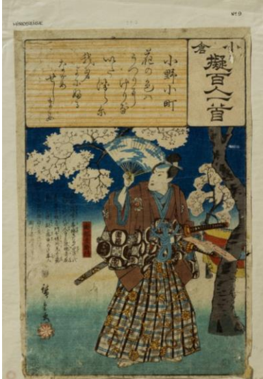
Figure 1 and 2 - Two of the scenes printed on washi paper

Ogura nazorae hyakunin isshu (Take-offs Based on the Ogura [Version] of the One Hundred Poets, 小倉擬百人一首, 1845—1848) series is a compilation of 100 brocade pictures (nishiki-e) illustrating the anthology of 100 tanka poems edited by Fujiwara no Teika (1162-1241) in 1230 titled Ogura hyakunin isshu (One Hundred Poems by One Poet Each).