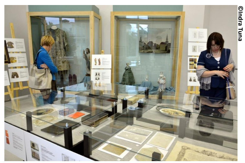
Top image: The poster session. Bottom image: Guests visiting the exhibition

RESTORATION OF AN 11TH CENTURY WOMAN'S CHOWN HEADDRESS WITH THICK TWISTS OF THEEAD