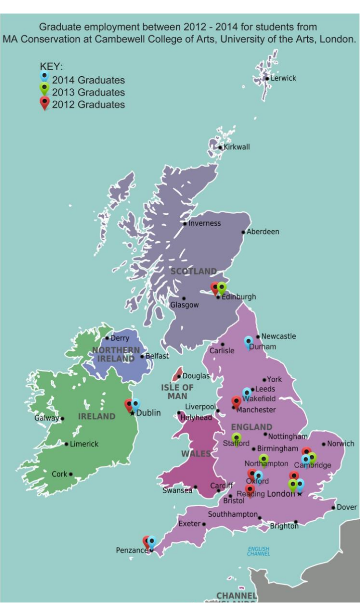
Map showing where graduates from Camberwell Collage of Arts from 2012-14 have gained paid employment or internships in the UK and Ireland

I asked some of my former classmates what advice they would give to someone looking for paid work upon graduating or for students currently studying conservation.