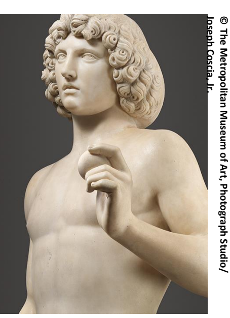
Adam, ca. 1490-95 (detail), marble, The Metropolitan Museum of Art, New York, Fletcher Fund, 1936

From the outset, it was clear that treatment of the the broken sculpture would be a formidable project, posing an unusual series of challenges with little in the way of past practice to draw on. The conservators had to find a method that would limit handling of the sculpture and position the heavy fragments precisely without abrading the fresh, vulnerable break edges. The importance of Adam warranted critical evaluation of the use of pins and adhesives traditionally used by conservators and an investigation into less invasive and more reversible Historically, approaches. the reassembly of large-scale sculpture Tullio Lombardo (Italian, ca. 1455-1532), has relied on the use of multiple iron or steel pins, supplemented, more recently, by structural adhesives such as epoxies.