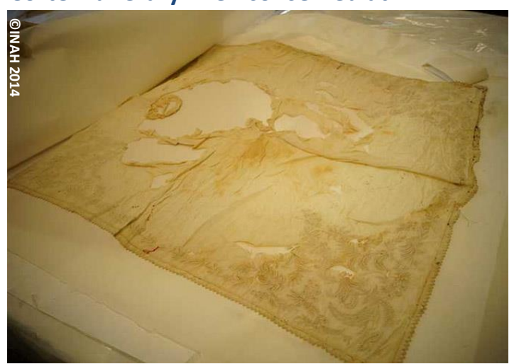
Cortez funerary linen during treatment

MEXICO CITY – Conservators working at the Instituto Nacional de Antropología e Historia (INAH) in Mexico have completed the conservation of a mortuary linen that enveloped the remains of Spanish conqueror Hernan Cortes.