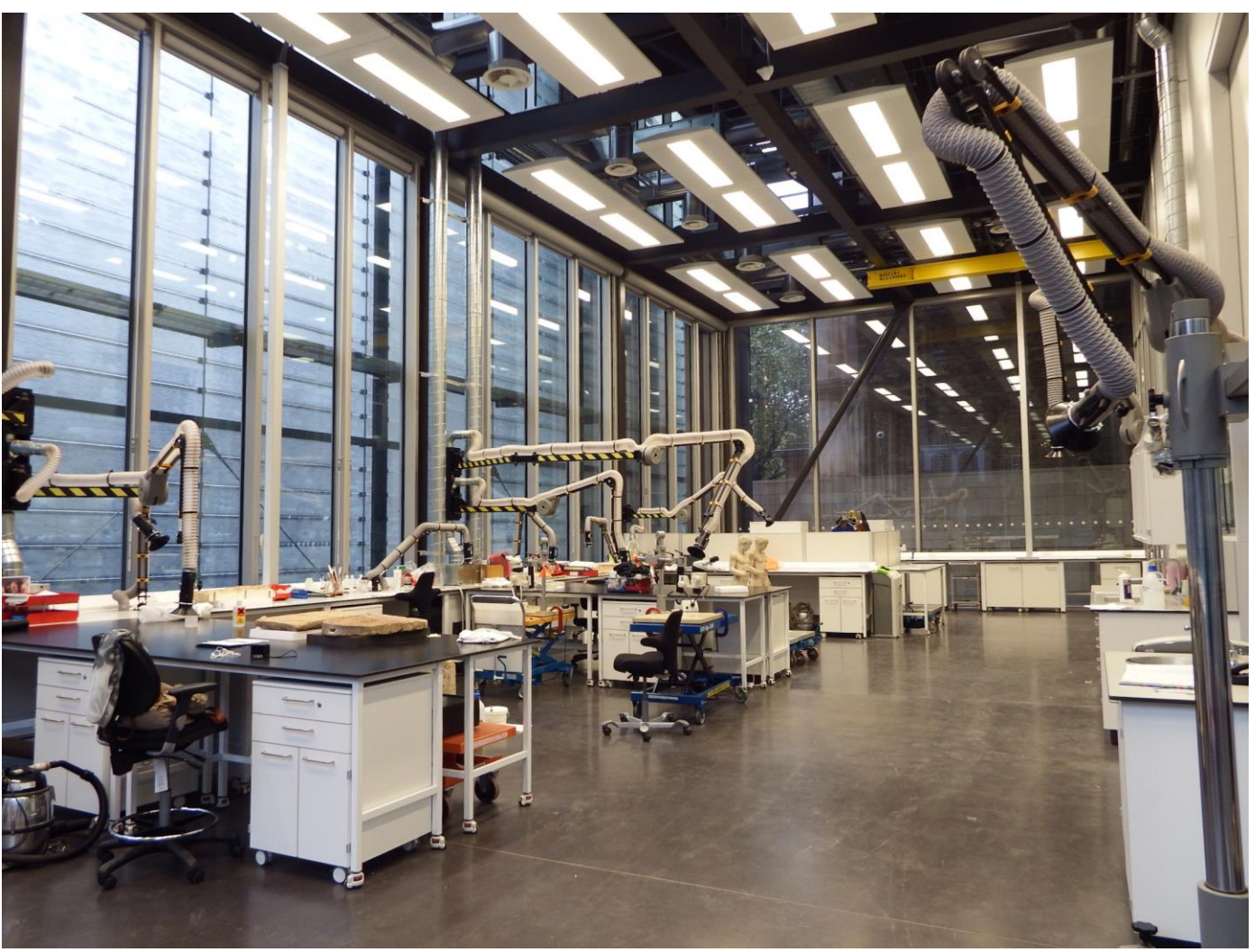
A view from the entrance to the sculpture conservation studio

square metres of storage below street level and the largest x-ray facility in the country (accessible directly from a loading bay). This arsenal of wonders will no doubts allow the museum to reaffirm its world-class standing.