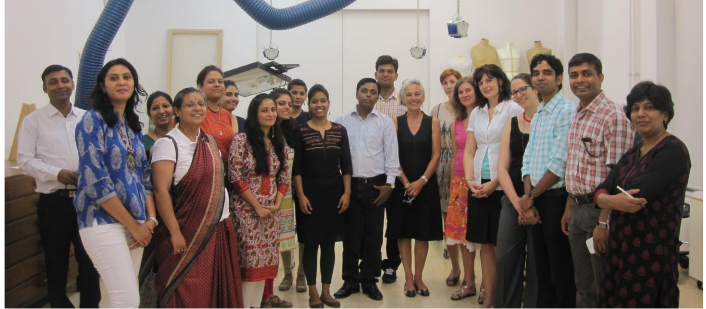
Participants to the Summer School

In the summer of 2014 the Institute of Conservation of the University of Applied Arts Vienna welcomed a group of students and teaching staff from the National Museum Institute, New Delhi. Twelve conservation students and two museology students from India had the opportunity to live and study in Vienna from July 14 to August 2, 2014. The Summer School was designed to provide hands-on experience in conservation and to enable the participants to gain deeper understanding about up-to-date methods in conservation and museology in Austria.