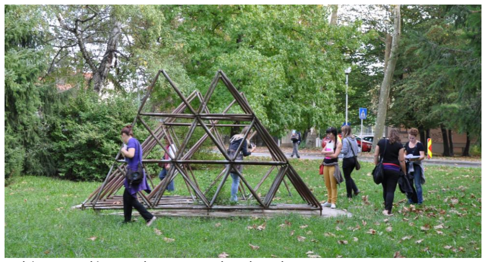
Both images on this page: The team at work on the sculptures

Within the framework of the aforementioned project, legal protection of the thirty-eight outdoor sculptures in Caprag was ensured. In 2012 the collection as a whole was listed on the Croatia State Register of Cultural Properties as a "Sculpture Park created in the context of the Sisak Ironworks Colony of Fine Artists".