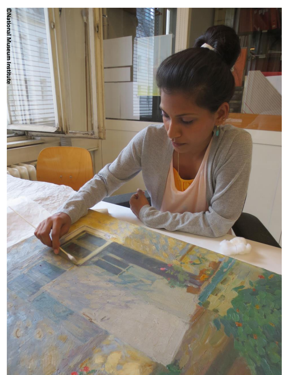
Workshop in the painting conservation lab: cleaning