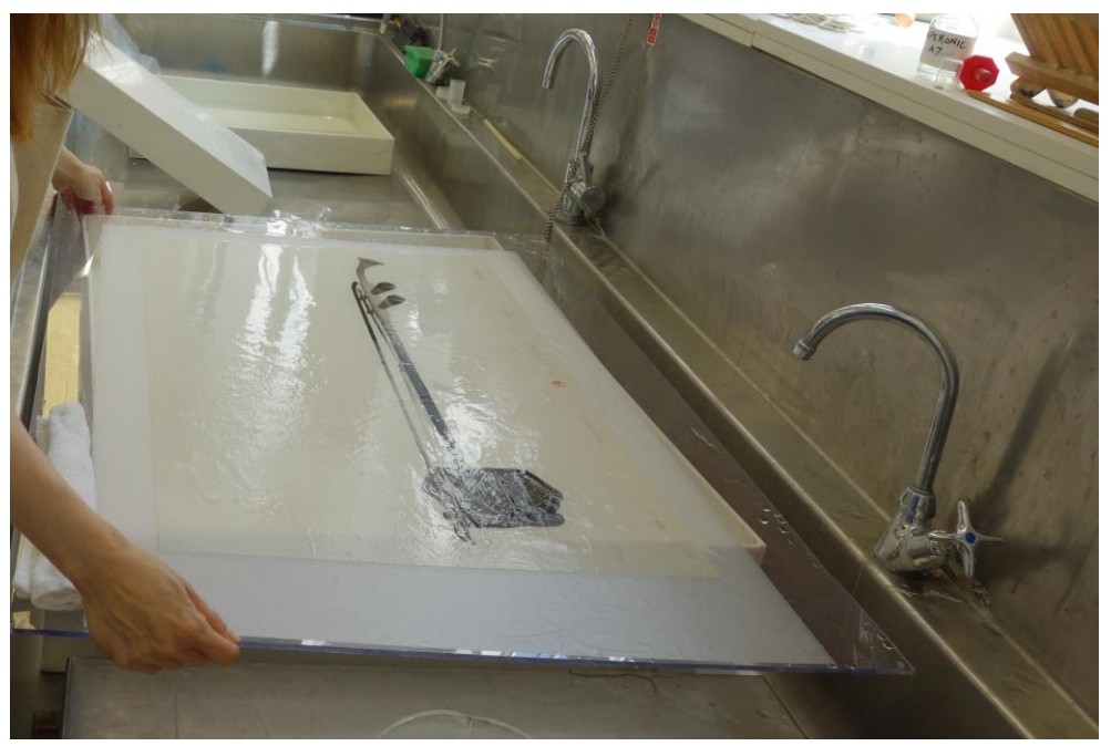
Wetting print on Perspex using adapted Chinese washing method

challenge А encountered during testing on life-sized samples was humidification. is thin and Xuan paper absorbent and has a tendency to adhere to the support as soon as it begins to absorb moisture. This prevents the lateral movement of the paper as its cellulosic fibres expand and as a result, creates and retains creases. (See Fig. 2). Xuan paper has low wet which made strength, it difficult to handle and manipulate after humidification, especially for untrained practitioners in conservation of Chinese art on paper.