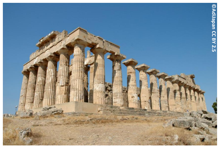
Greek Temple of Hera (Temple E) in Selinunte

Originally a Greek settlement, at its peak in 409 BC the population reached 30,000 excluding slaves. Thanks to maritime trade