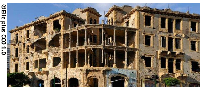
BEIRUT - The Barakat House, also known as the 'Yellow House' is a residential structure first constructed in the 1920s, and that is now being restored as Beit Beirut, a cultural centre that will honour the city's heritage.

Located in the Lebanon's Ashrafieh area, the building will be restored after nearly 40 years after the start of the Lebanese civil war, and will be a place of memory and heritage dedicated to the city and its evolution.