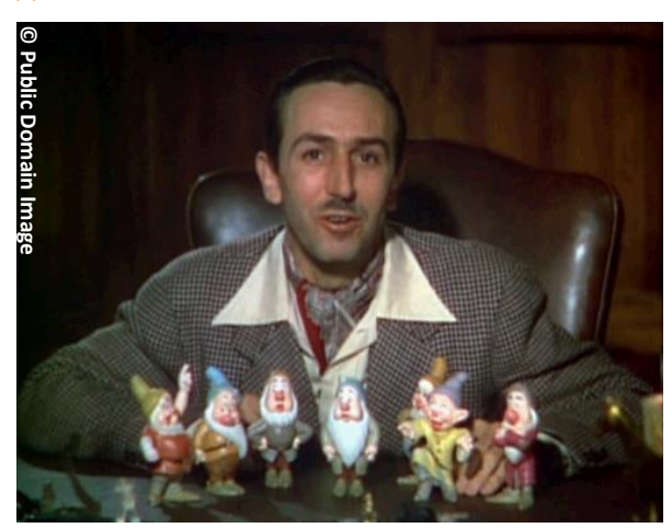
Walt Disney introduces each of the Seven Dwarfs in a scene from the original 1937 Snow White cinematic trailer

Earlier cels were made of cellulose nitrate whereas later ones used cellulose acetate, both vulnerable to deterioration.