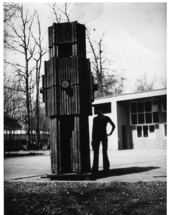
A period image of one of the sculptures

The city of Sisak, located southeast of Croatia's capital Zagreb, boasts a unique sculpture park, comprising thirty-eight outdoor sculptures created between 1971 and 1990. The park was created by the prominent sculptors of what was then Yugoslavia who participated in the Sisak Ironworks Colony of Fine Artists [Kolonija likovnih umjetnika "Željezara Sisak"]. The artists' colony was open to sculptors, painters, graphic artists and photographers. During its twenty-year period more than 700 artworks were created.