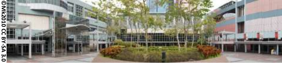
Panorama view of the History Museum in Hong Kong

Textiles represent an indispensable part of the inheritance of mankind since the beginning of a long history. Embodied in various forms, these beautiful objects have, through the ages, been used to express aesthetic inspirations amongst other functional, conventional and religious intents.