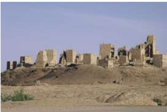
Pre-Islamic walled town of Baraqish