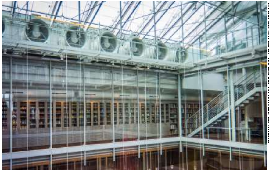
Renzo Piano designed atrium at the Harvard Art Museum

CAMBRIDGE - Harvard University has been awarded a $506,000 (£405,000) grant from the Andrew W. Mellon Foundation for use by the Harvard Art Museums to establish a new Summer Institute for Technical Studies in Art (SITSA). The programme, designed for graduate students from art history programs across North America who are interested in broadening their experience with object-focused technical inquiry, methodologies, and instruction, will begin in June 2017. It builds on the accomplishments of the Summer Institute in Technical Art History (SITAH), developed by and conducted at New York University over the past five years.