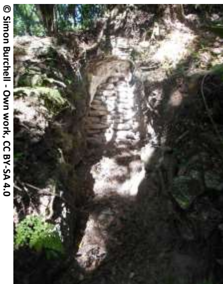
Evidence of looting activities

Experts understanding of Mayan sites in Guatemala has been hindered by the prolific activities of looters operating, at times undisturbed, among archaeological ruins in the country.