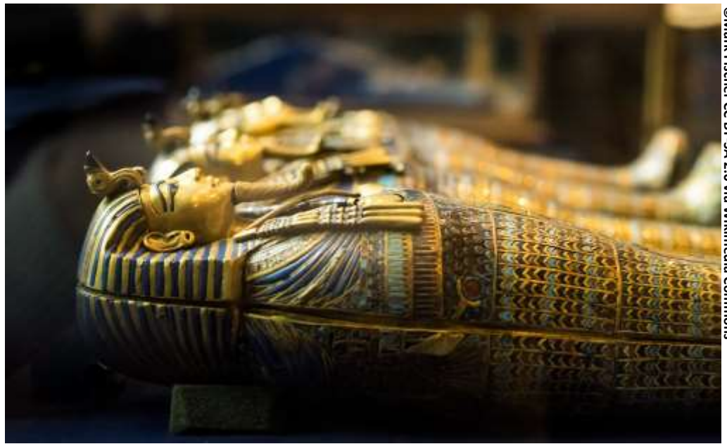
Four small gold coffins from the tomb of King Tutankhamun on display in the Egyptian Museum in Cairo, Egypt

To learn more about this project and other projects funded by AFCP visit: https://eca.state.gov/cultural-heritage-center