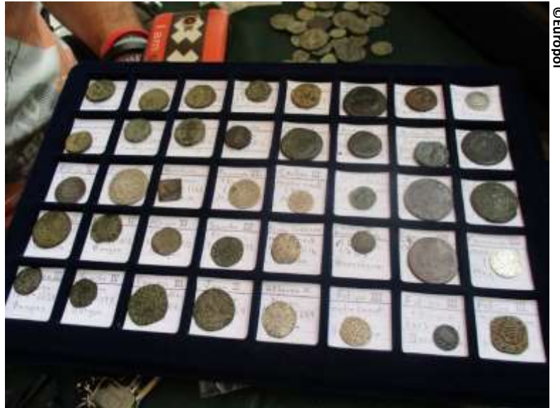
Some of the items seized by Europol