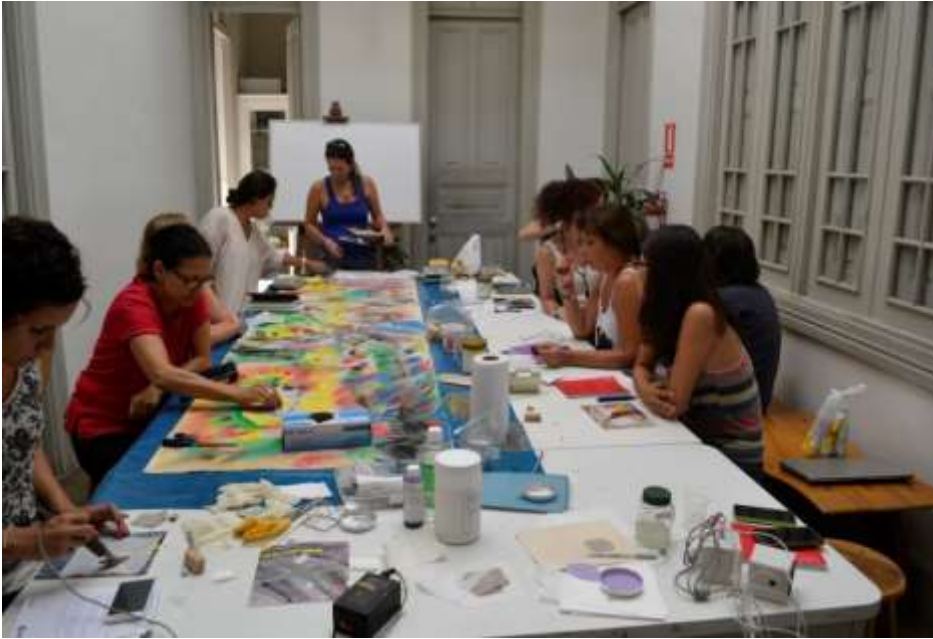
Experimenting with dry cleaning materials and techniques

I included two reading seminars. The day before each reading seminar, I gave participants a list of related discussion questions to consider. Paired participants chose one of the assigned readings for which they would lead the group discussion. The readings and discussion questions encouraged debate while keeping the participant-led discussions on point. All participants had the opportunity to lead and have their voices heard. I was pleased with how eagerly the participants took charge of their assignments and at the depth to which we carried discussions on large, important topics.