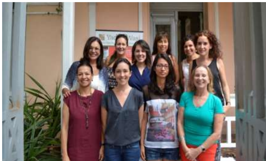
All participants at the end of the workshop, standing outside the Yachay Wasi Institute

Workshop participants also learned through small team exercises. After lecturing on environmental conditions, I divided the participants into small groups to discuss a case study in which a colour-sensitive plastic mobile was to be exhibited in a window-filled museum lobby. Each group presented a plan for testing and monitoring the environmental conditions in the proposed exhibition space, devised a method for identifying the artwork materials, recommended parameters for display, and then developed exhibition recommendations for the installation space. While the groups agreed on environmental standards for the installation, each group had a different solution for how to accomplish them.